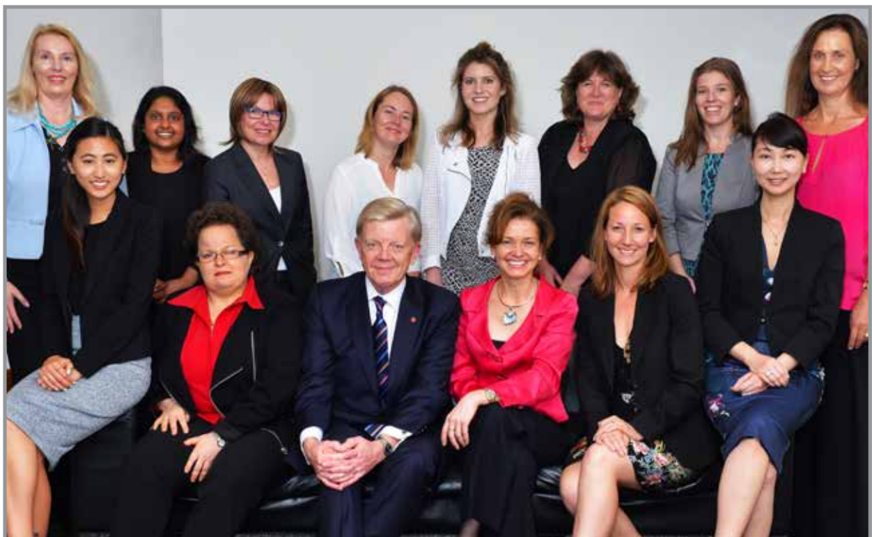
MTAA Staff, November 2015